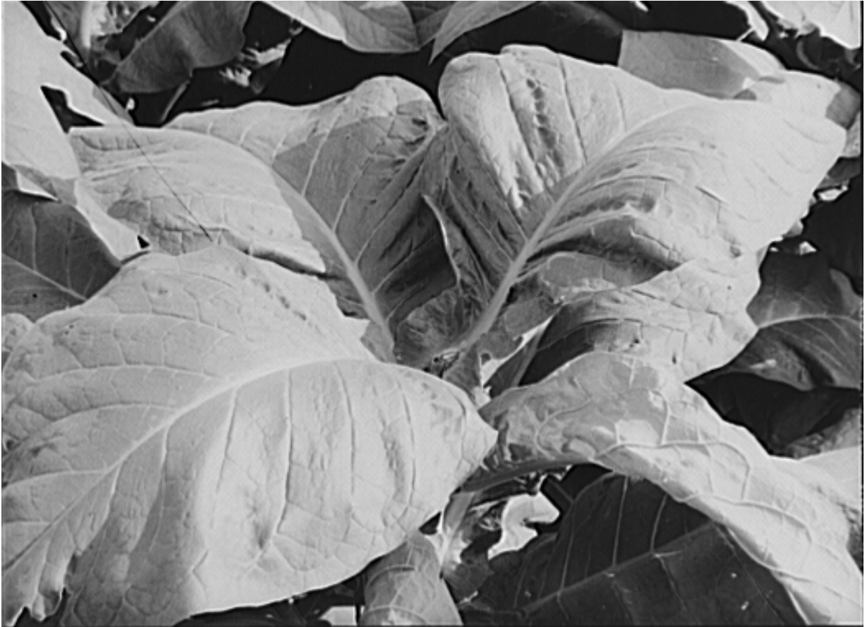
Photograph of a tobacco plant by Sheldon Dick, August 1938. From the Library of Congress.